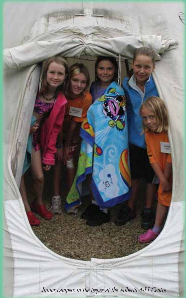
Junior campers in the teepee at the Alberta 4-H Centre