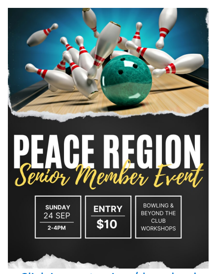
Click image to view/download