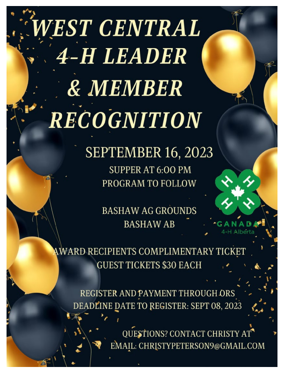
Click image to view/download