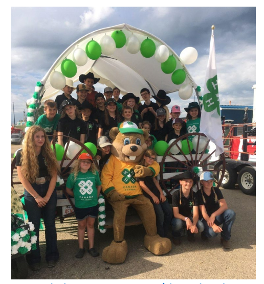
Click image to view/download

Crestomere 4-H Multi Club won their division for their club float in the Ponoka Stampede, June 26 - July 2, 2023.