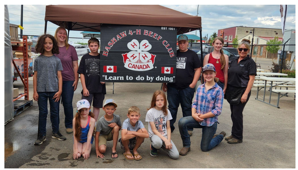
Click image to view/download

In June, Bashaw 4-H Beef Club hosted a BBQ fundraiser in partnership with Mainstreet Hardware (a division of Peavy Mart) in