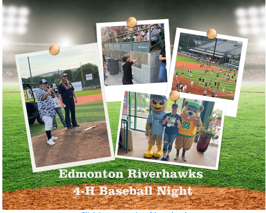
Click image to view/download

The Edmonton Riverhawks look forward to hosting another 4-H Baseball Night next season ~ hope to see you all there!