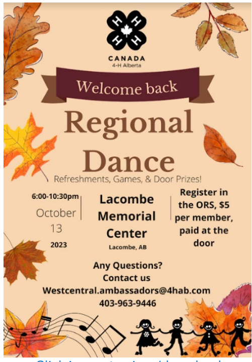
Click image to view/download