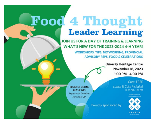
Click to view/download