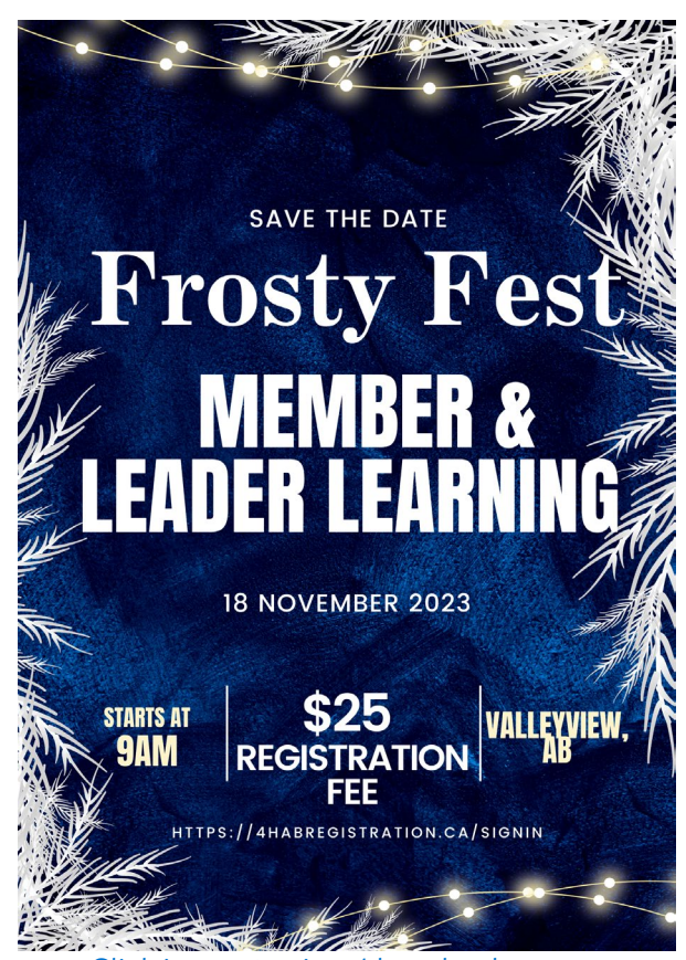
Click image to view/download